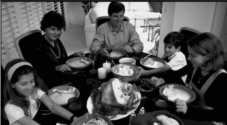
Youth Town's Foster Care Program will be a refuge for kids without a home and kids who can no longer go home.

Where do you turn when you have no family to turn to? Where do you go when you can no longer go home? Sadly these are questions that thousands of kids are faced