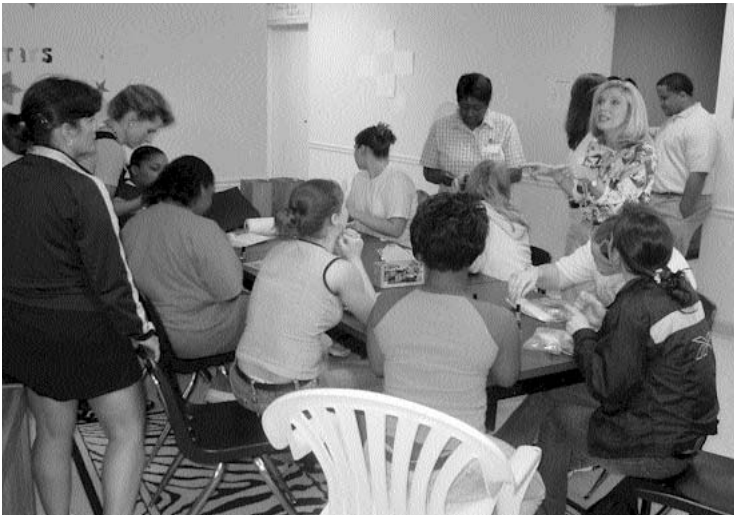
The Women of the Jackson Service league put together a makeover party for the girls at Youth Town.

served as an example of consistency for the kids. Year after year they return and